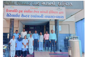
A community meeting was organised in Netrang at the Community Health Centre