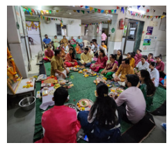
Ganesh puja was organised

Lenskart people conducted a campus interview of all our interns and we are happy to note that all our students are selected by them with CTC of Rs. 28,000/-. This is a big achievement for the college.