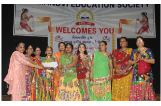
Staff members and students participated in the annual function and performed very well