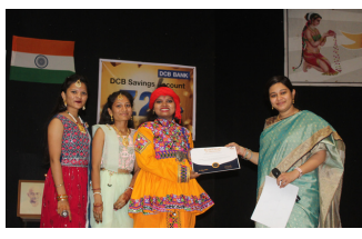
DCB bank handed over school bags to all the school children who have made academic progress during the year as a part of their CSR activities.