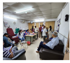
blood donation camp was organised