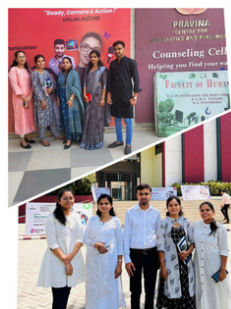
faculty development programme