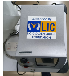
Green laser donated under the LIC Golden Jubilee Foundation