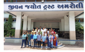
Educational tour of staff members was organised in two batches. They visited Surat Manav Seva Sangh - Chhanyado, Jeevanjyot trust - Amroli.