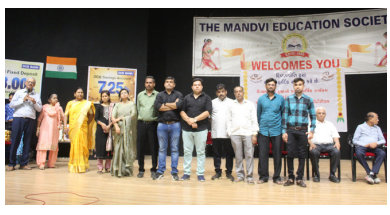
Core group members were felicitated with a plaque and a token gift

12th annual function was celebrated with great enthusiasm. Staff members and students participated in the function and performed very well. Winners of the performances will be given a certificate and a prize in the next staff meeting. Our core group members who have been with us for more than five years and whose performance has been vital in rapid progress of activities at Divyajyoti trust were felicitated with a plaque and a token gift. DCB bank handed over school bags to all the school children who have made academic progress during the year as a part of their CSR activities. We are thankful to the bank authorities for their kind gesture. A blood donation camp was also organised on 21st in the morning. 27 bottles blood was collected. Ganesh puja was organised on 22nd in the afternoon. Five staff members got an opportunity to be the host.